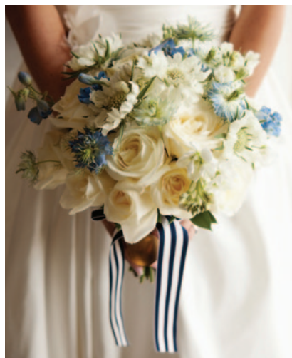
nautical nosegay A thick-striped ribbon is a seaside addition to a Connecticut beach wedding bouquet.