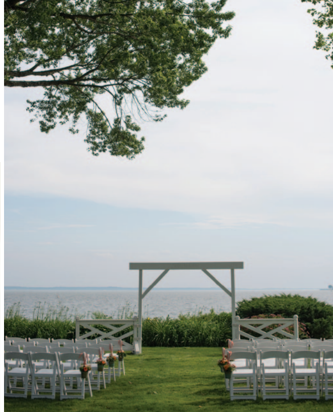
great estate The exquisite Eolia Mansion at Harkness State Memorial Park.